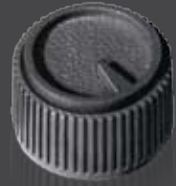
molded indicator knob