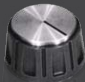
metal cap knob