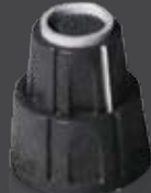
raised ring top knob