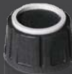
raised ring top knob