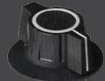
full bar and solid skirt