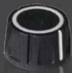
flat top knob