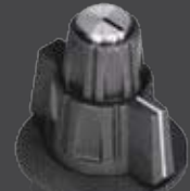
full bar and solid skirt