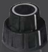
flat top knob