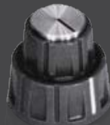
metal cap knob